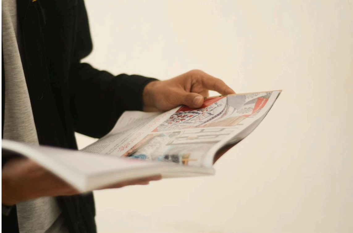
Photo of a person reading from a magazine.

Do you have a story idea about impactful work an OSDIA member or a lodge is doing in their community? Are you interested in writing for the most widely read magazine for people of Italian heritage in the United States? We want to hear from you! For consideration in Italian America magazine, which reaches more than 25,000 people each quarter, please submit your story pitches to italianamerica@osia.org .