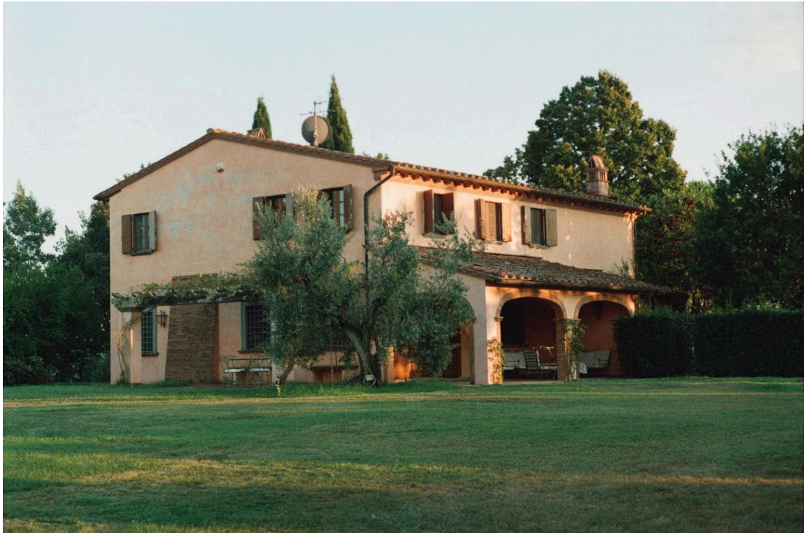
Photo of a rustic Tuscan villa.

Are you interested in purchasing a home in Italy, but curious about Italian tax laws and their implications for citizens vs. noncitizens?